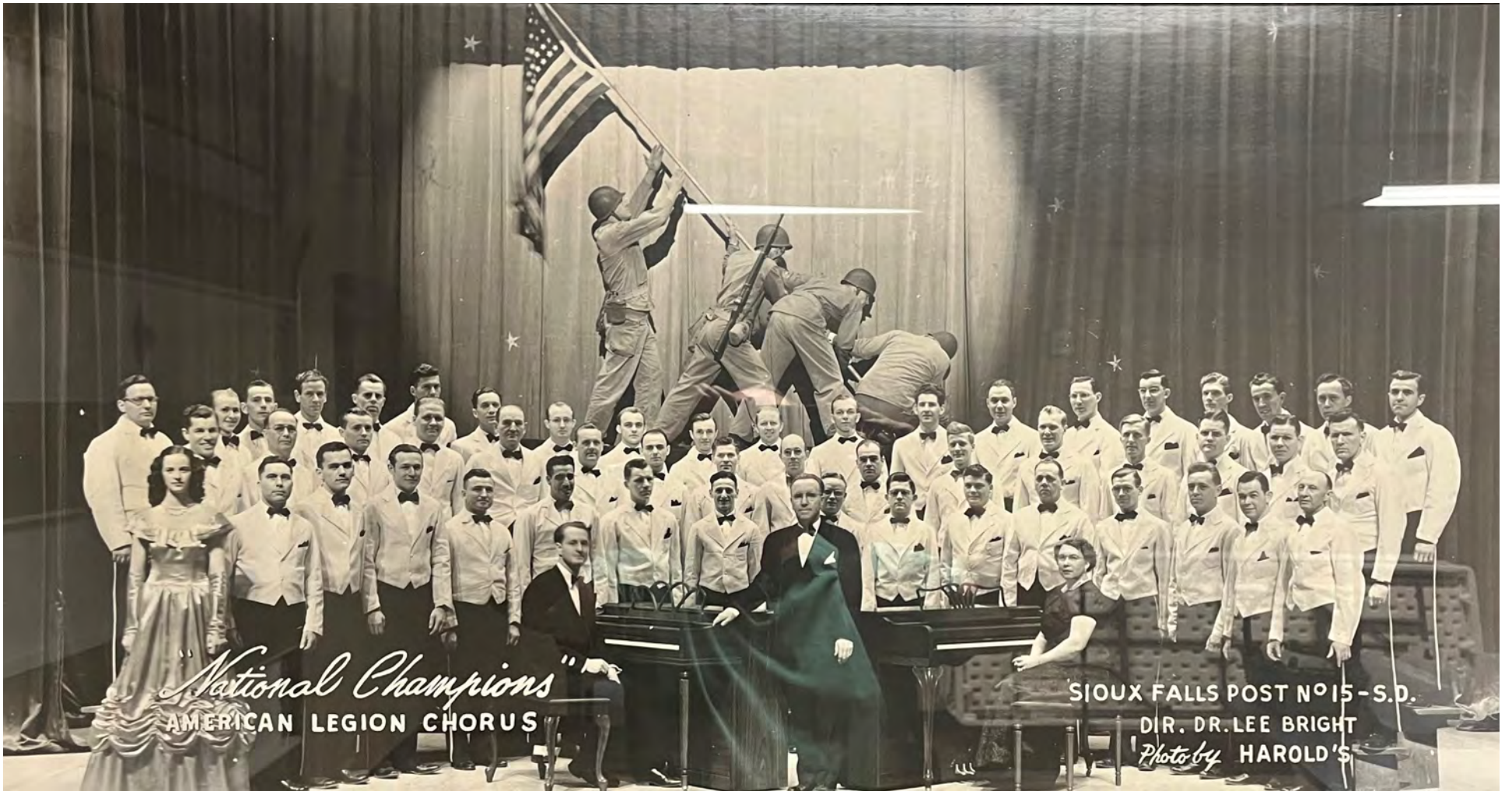
(Above) The 1949 co-hort for the Singing Legionnaires. (Below right) The Singing Legionnaires perform at a Veteran's Day celebration in 2021. (Below) 2018 Singing Legionnaires.

The Singing Legionnaires of American Legion Post 15 in Sioux Falls are honored to be celebrating their 75th anniversary this year. In the post-World War II era, the men's chorus was formed in Sioux Falls in 1947 and quickly grew in number to over 50 singers in the chorus. For thirty years, the chorus traveled to attend the annual American Legion National Convention, where they competed against other similar American Legion men's choruses. In those competitions, they garnered twenty first-place awards and placed either second or third-place in the remaining ten competitions.