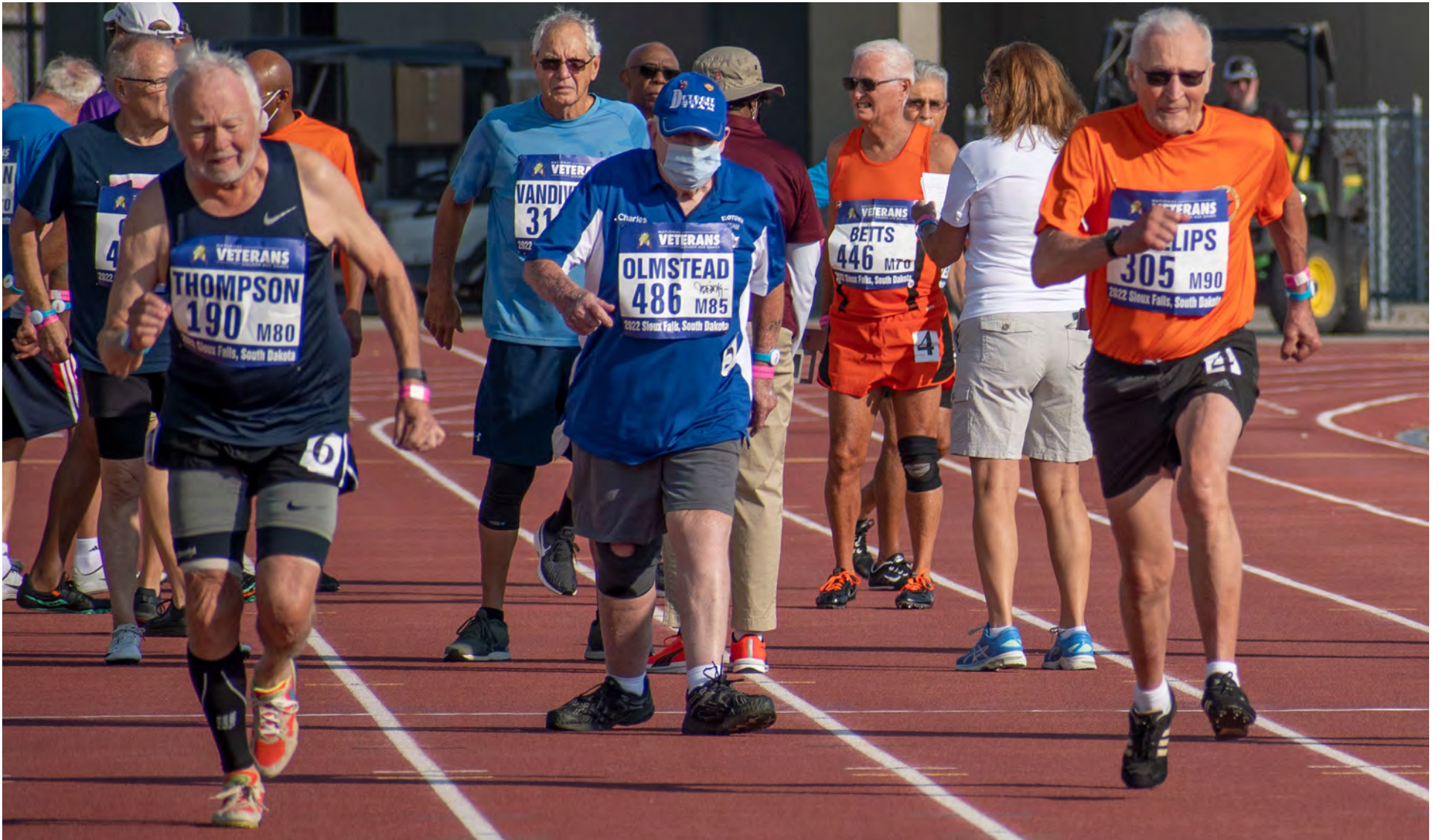
Veterans race during a track event on day three of the National Veterans Golden Age Games.