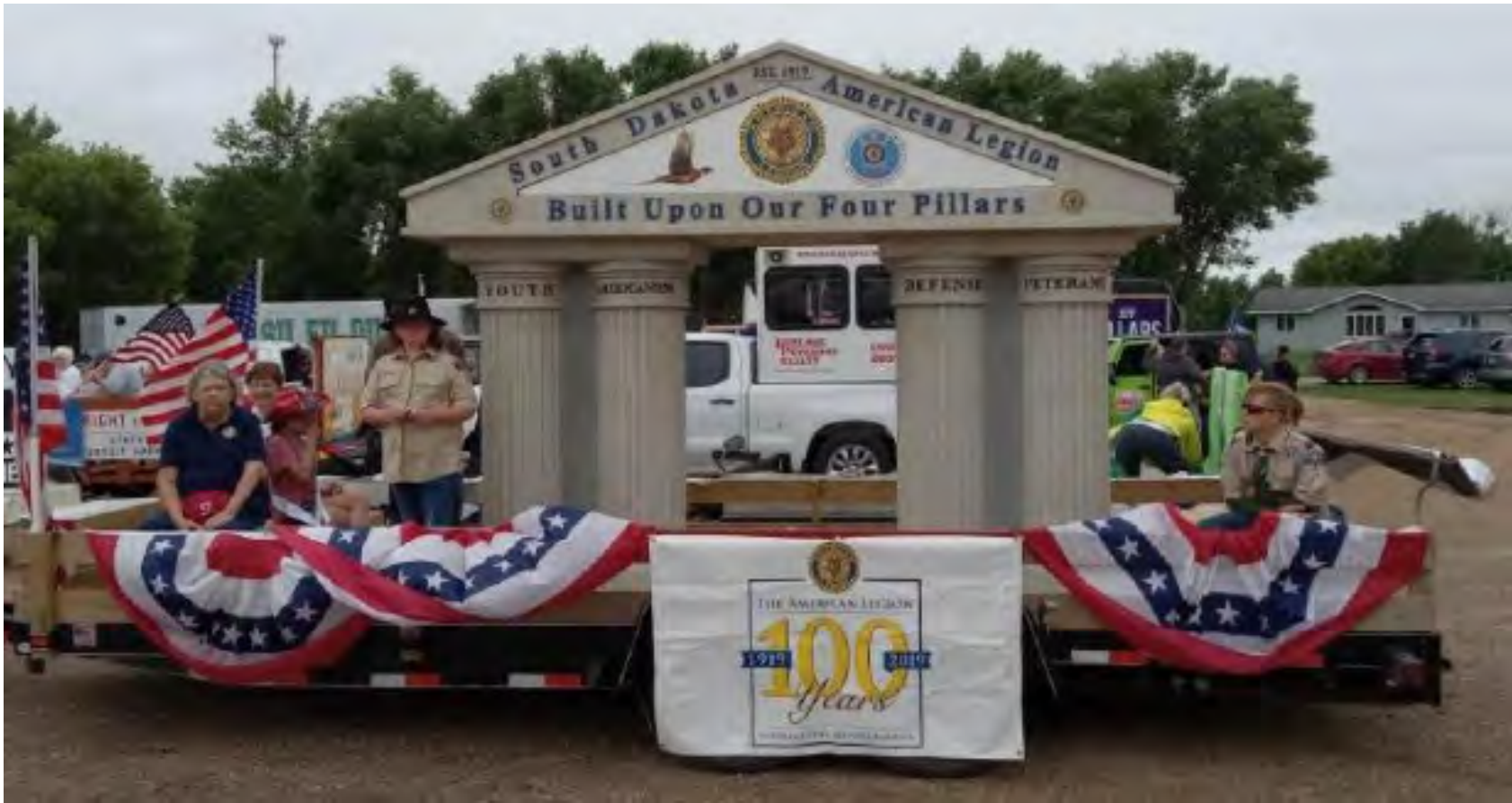
(Left) The South Dakota American Legion float at Aurora, SD's Gala Days on August 9. The float is manned by Post 230 Auxillary, Junior Auxillary and scout members. The Gala Days was also the first time Post 230 had a color guard during the parade.