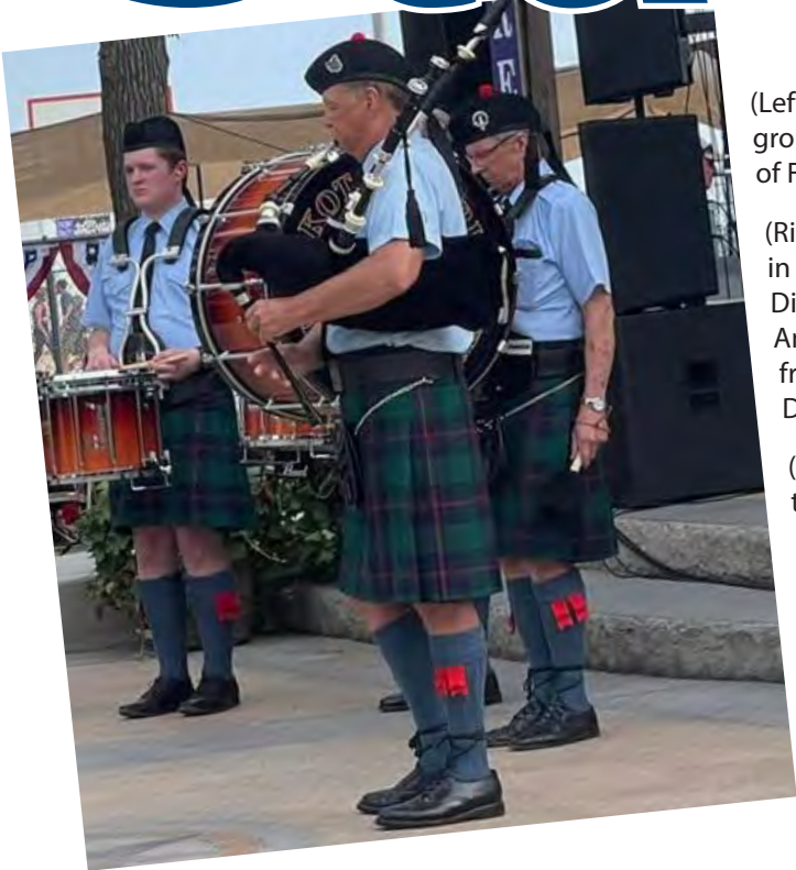
(Left) The Dakota District Pipes and Drums group performed at the Parkston Celebration of Freedom event on Thursday, June 30.