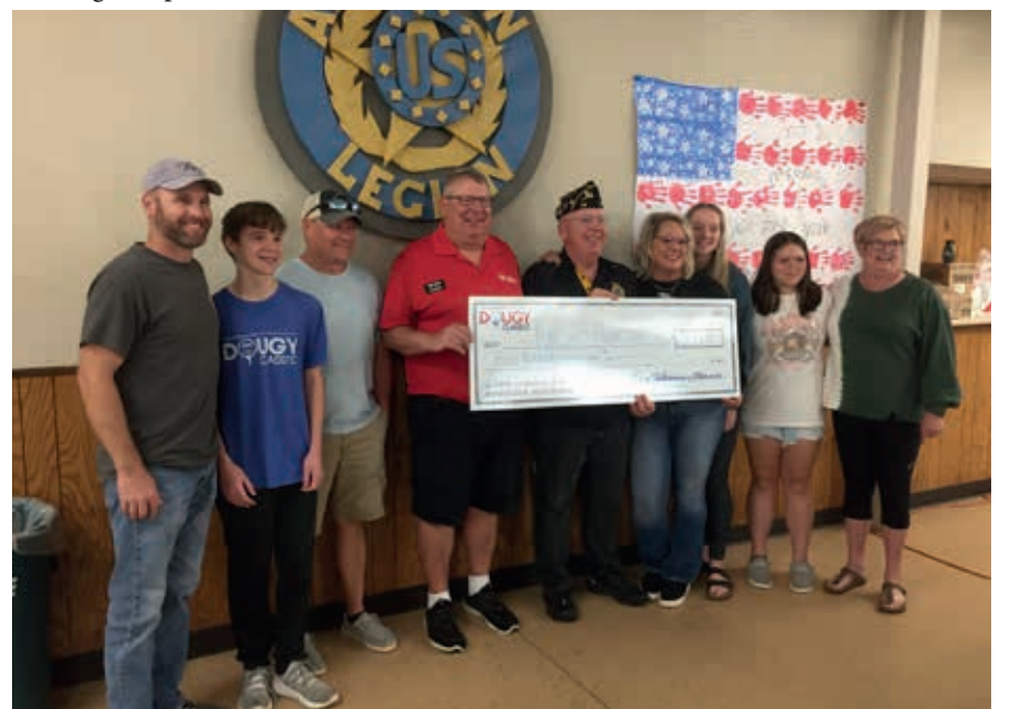
Henry G. Fix Post 23 of Garretson had phenomenal success with their "Send One" Midwest Honor Flight fundraiser: they raised over $10,000 in on day which will be used to send Veterans to DC on a future Honor Flight.