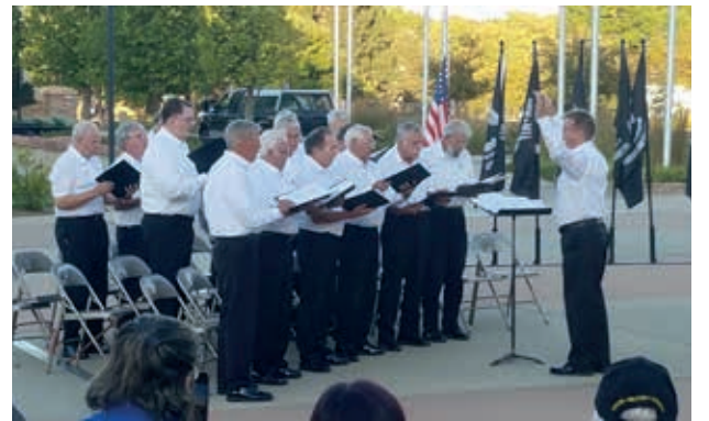
The “Singing Legionnaires” of Post 15 perform in front of a row of POW/MIA flags which represent commemorate the seven South Dakota Service Members still missing from the Vietnam War. The group performs several times a week for community functions throughout the Sioux Falls area.

The Post is also extremely active in the community – they supported 43 Boys State Candidates and helped their Auxiliary send another 43 girls to Vermillion this last summer.