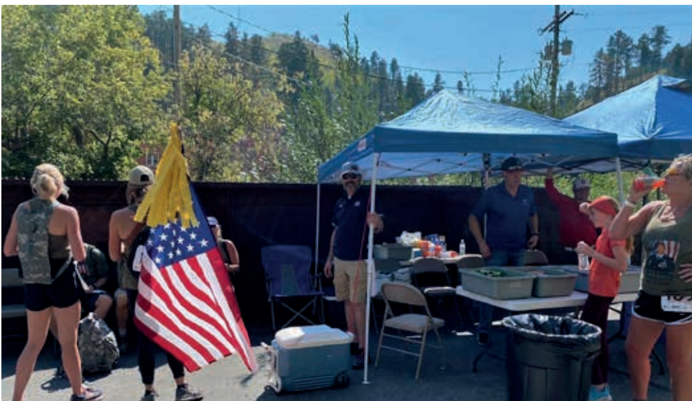
Post #22 members of Rapid City man a refreshment table at the Black Hills Veterans March, which had over 100 participants this year throughout the categories.