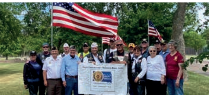
Milbank Post 9