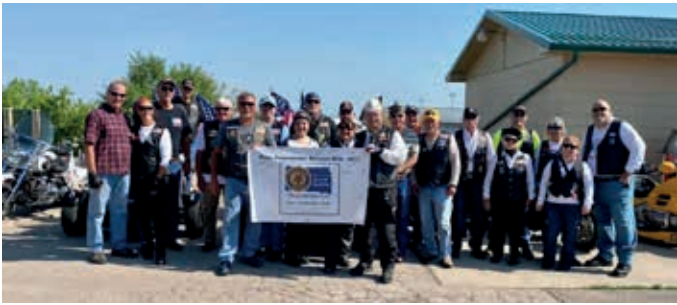
Spearfish Post 164