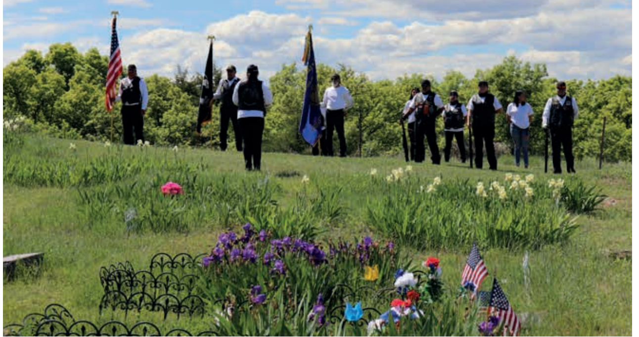
National HQ, Indianapolis

Since the early 1920s at Chauncey Eagle Horn/Philip Iyotte American Legion Post 125 on the Rosebud Indian Reservation in South Dakota, Memorial Day has been more than a ceremony.