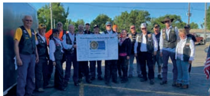
Watertown Post 17