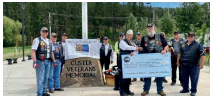
Arlington Post 42