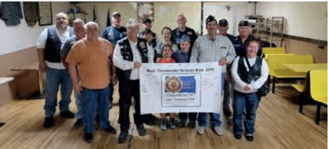
Mobridge Post 4