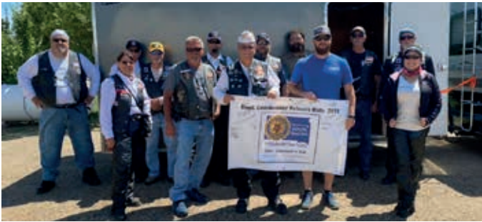
Lemmon Post 66 Thunder Hawk Post 279