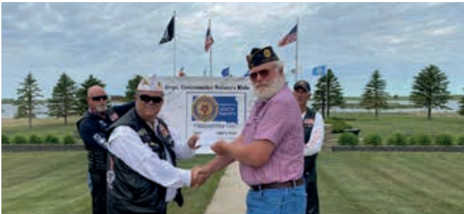
Eureka Post 186