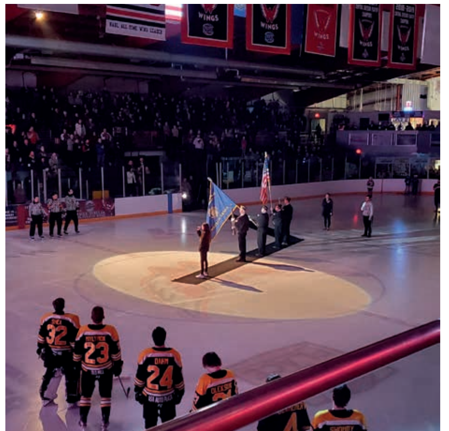
Redfield Post #92 Color Guard presents the colors at the X-Aberdeen Wings Hockey Game on March 6, 2021.