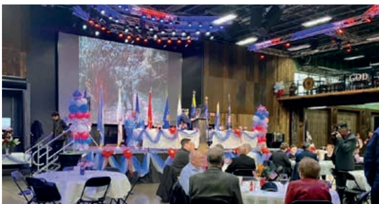
Sioux Falls Post #15 pulled out all the stops in decorating the Military Heritage Alliance Center for the American Legion Birthday Celebration on March 15, 2021.