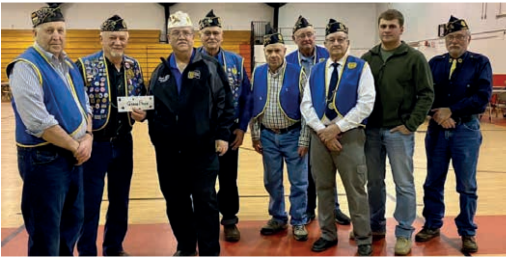
February 27, 2021 was Wagner Post 11's 32nd annual Sweepstakes event. It is the biggest fund-raising event for them each year. The grand prize is $5,000 cash, with the total of the 107 prizes valued at over $25,000.