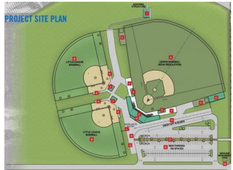
Proposed Milbank American Legion Baseball Facility

Milbank's Legion Baseball Facility was located adjacent to an expanding school campus. In order to allow the growing school to continue expanding, it was determined that the best course of action was to tear down the baseball facility and rebuild it on a new site. The new complex will include two youth fields, a Legion field, a grandstand, and a centralized building with restrooms and a concession stand. This project will not only build a new baseball complex. It will build upon the legacy of Milbank and Legion Baseball and create a memorial that pays respect to the thousands of young men that have participated in the program since Legion Baseball's conception in 1925.