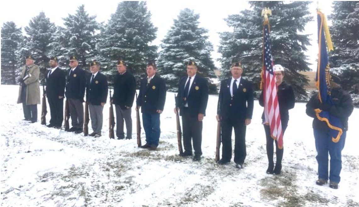
Above: Members of Chester Post #136 provide funeral honors for a local veteran