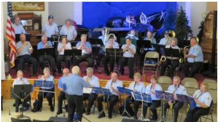
The South Dakota American Legion Band plays at the Western Heritage Center in Spearfish at the 2018 Department Convention.

This article is especially targeted to instrumental musicians who have been involved in the South Dakota American Legion Band at some point or would like to be. This year the state American Legion convention is scheduled for June 19-21 in Huron.