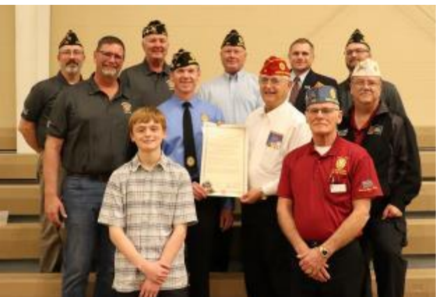
Sons of the American Legion Members from the Ruste-Wahl Squadron #154 in Montrose receive their charter, dated 100 years to the day from the formation of their American Legion post. Alexandria Squadron #41 also received their charter.