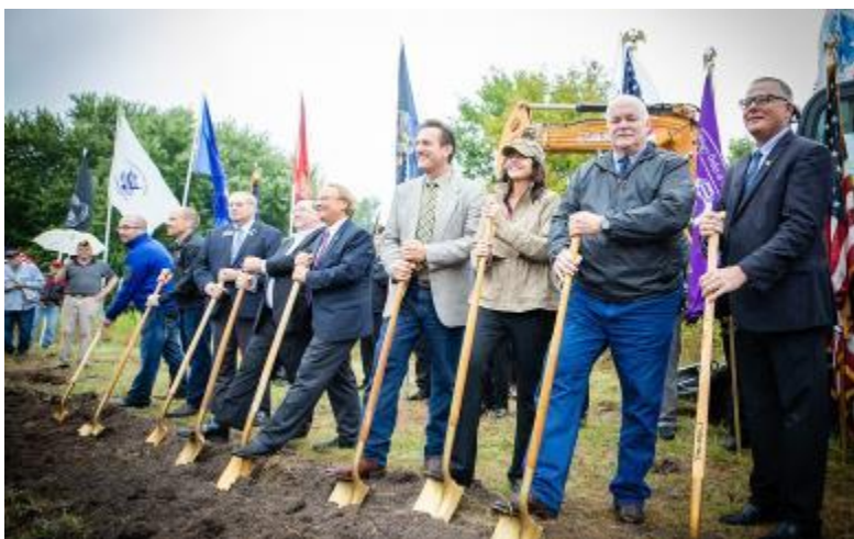
Above: Leaders from across the state take part in the groundbreaking ceremony for the South Dakota State Veterans Cemetery on September 9th, 2019.

PIERRE—President Harry Truman once said this: “Our debt to the heroic men and valiant women in the service of our country can never be repaid. They have earned our undying gratitude. America will never forget their sacrifices.”