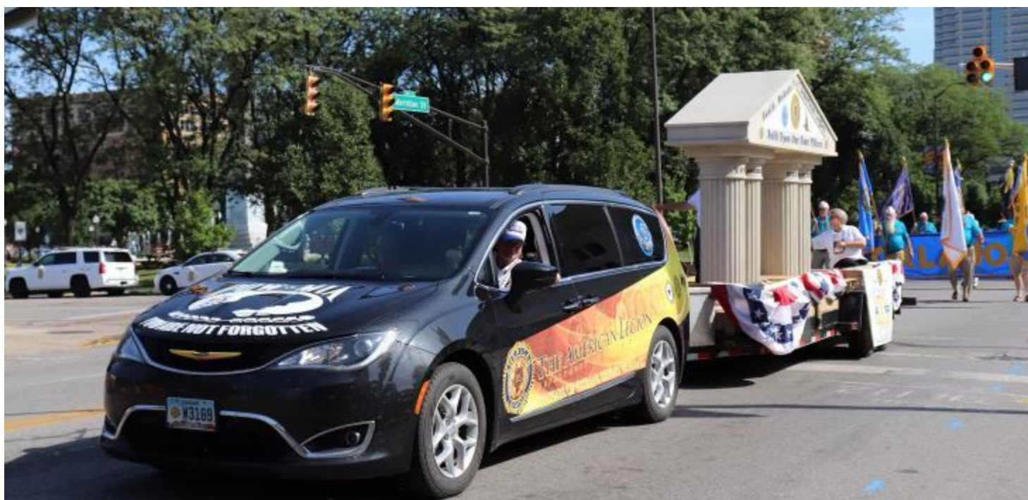
The 101st National Convention was held August 23-29th, 2019 in Indianapolis, Indiana. The South Dakota Delegation attended meetings, workshops and had a great time networking with Legionnaires from across the country and around the world.