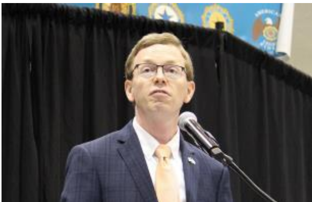
U.S. Congressman, Dusty Johnson addressed the American Legion Convention on Saturday, June 9th. Johnson gave the convention delegates an overview of the issues that he is working in Washington, D.C. concerning the veterans and their families. We appreciate Representative Johnson taking time out of his busy schedule to address our convention.