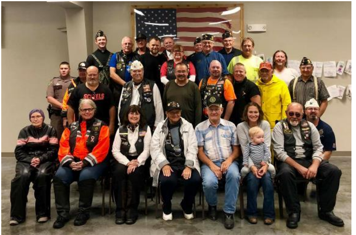
Team Legacy resting up and drying off at Post 14, Wessington Springs.