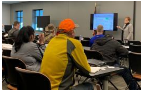
Above: Veterans attend a VBOC training workshop in North Dakota.

The VBOC’s primary focus is training workshops in the forms of Boots to Business, held on military installations, and Boots to Business Reboot, held off installations. Boots to Business and Boots to Business Reboot both provide participants with an overview of business ownership as a career vocation, an orientation to the components of a business plan, a practical exercise in opportunity recognition, and an introduction to available public and private sector resources.