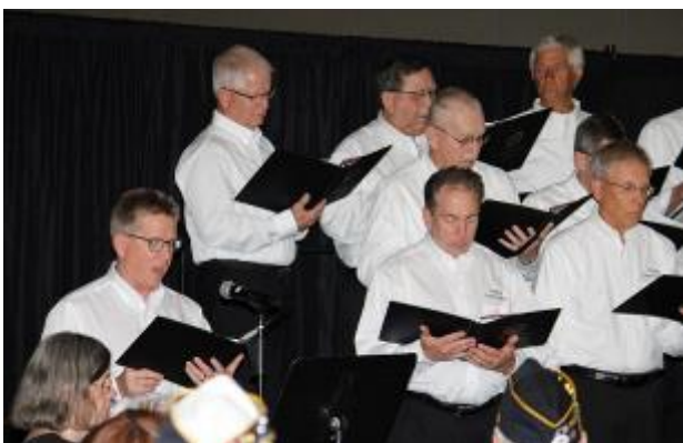
The Singing Legionnaires from Sioux Falls Post #15 did a fantastic job Providing beautiful music during the Memorial Service. The Singing Legionnaires also provided musical selections at the Joint Banquet.