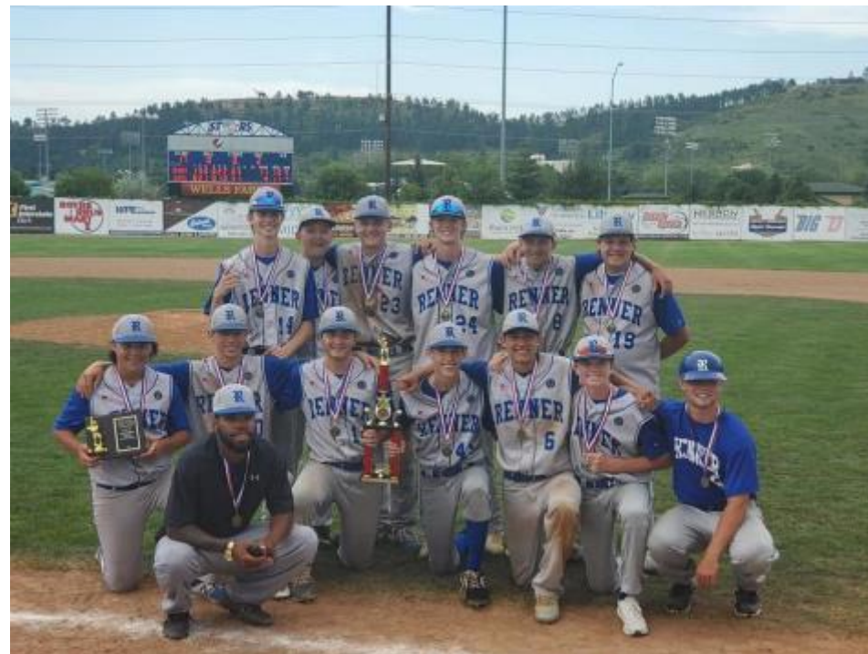
2019 Junior "A" American Legion Tournament Champions, Renner Post #307