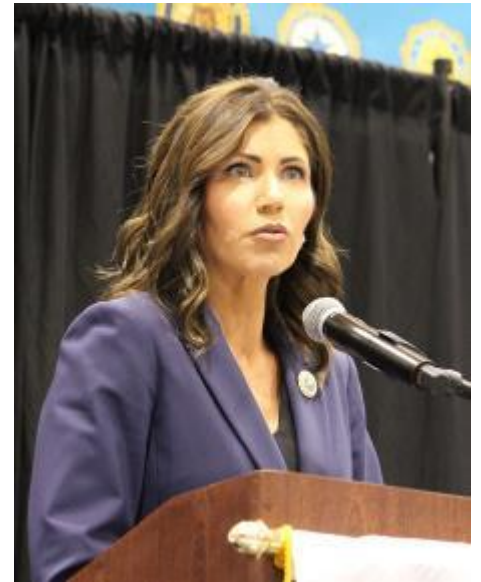
Governor Kristi Noem addressed the American Legion Convention on Saturday, June 8th. We appreciate Governor Noem taking time out of her busy schedule to address our convention.