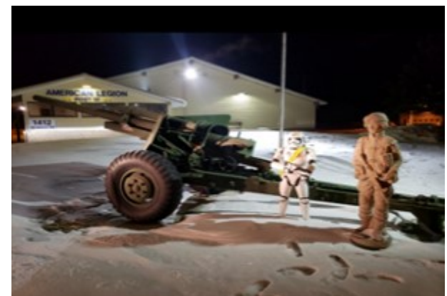
A Storm Trooper was caught on guard duty at the Codington Post 17, in Watertown, SD.