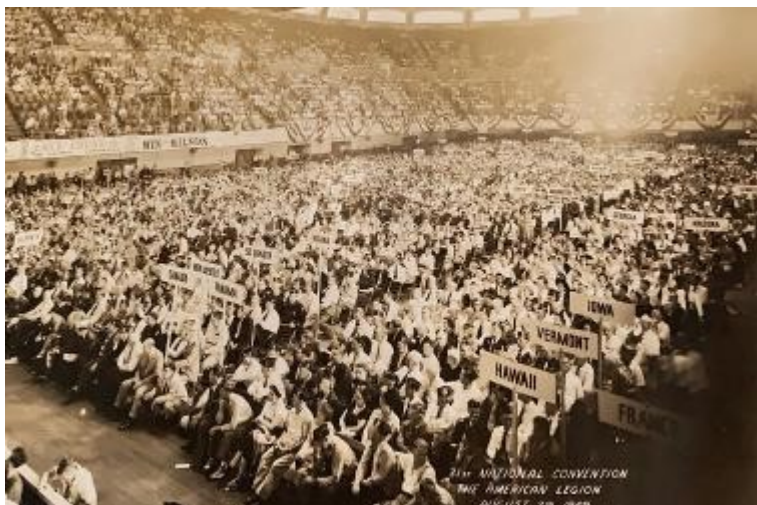
Photo taken at the 1949 National Convention in the city Philadelphia, Pennsylvania. Notice where our great state is sitting?

Pictures from our past highlighting the rich heritage of the South Dakota Legion